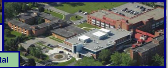
Stratford General Hospital

Newly developed ER, OR and Medical Imaging in North Wing